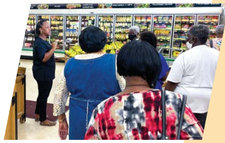
▲ EFNEP program assistant for South Carolina State 1890 Upstate Region begins the supermarket tour with shopping the perimeter of a store to access fresh vegetables and fruit.

The United Way of Anderson County in South Carolina revealed that 65% of local adult residents are either